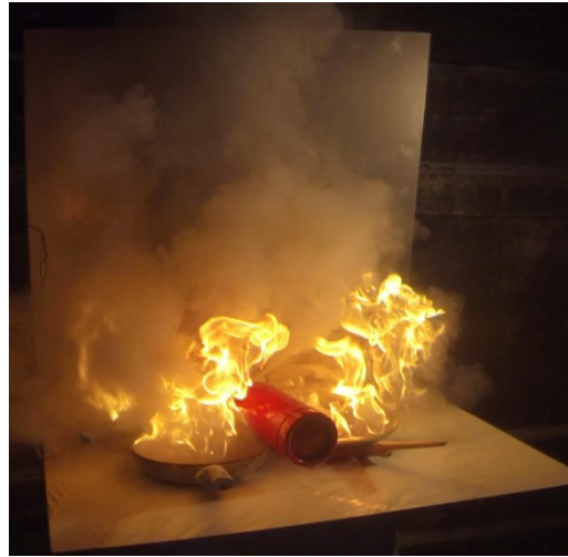
DETECTION OF HEAT, BY HEAT SENSOR