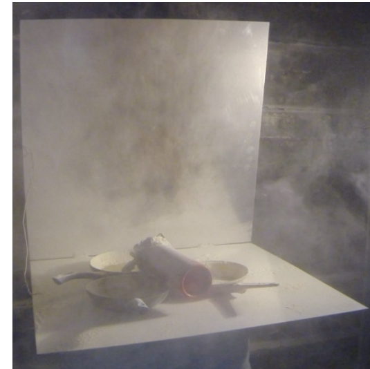
STATE AT THE END OF THE EXPERIMENT