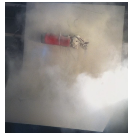
STATE AT THE END OF THE EXPERIMENT