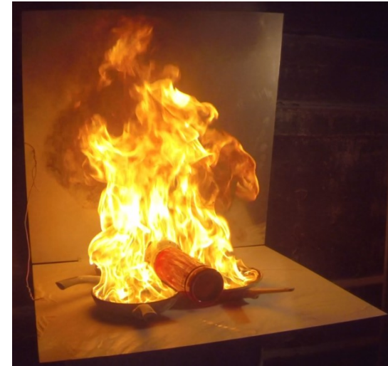
A MOMENT LATER , AUTO ACTIVATION PHASE