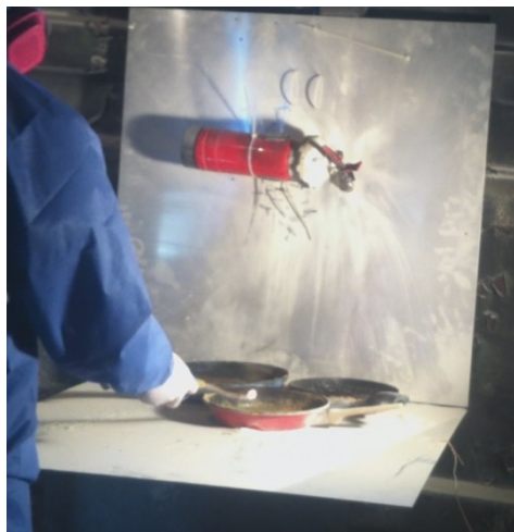
LIGHTING OF FIRE