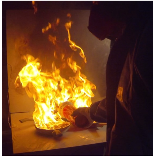
THROWING OF THE FIREBLASTER INTO THE FLAMES