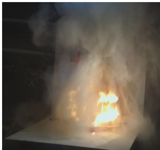
FLAMES SMOTHERED BY “BLANKET” OF POWDER