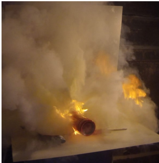
FLAMES SMOTHERED BY "BLANKET" OF POWDER